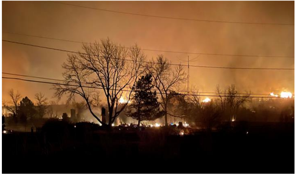
View of Jim KH6HTV QTH during the night of Dec 30. His tower is visible in the center.

On Thursday, December 30th, Boulder County was attacked by a severe windstorm with winds exceeding 100mph. A grass fire started near the base of the mountains in Marshall. The winds rapidly created an extraordinary firestorm. It was too big and fierce for firemen to battle. The only battle was evacuation as the towns of Louisville and Superior and northern suburbs of Denver lay in the wind driven path. The only thing that contained the fire was the winds finally stopping during Thursday evening. By that time hundreds of homes had burned down. This was not a typical forest fire, but an urban firestorm.