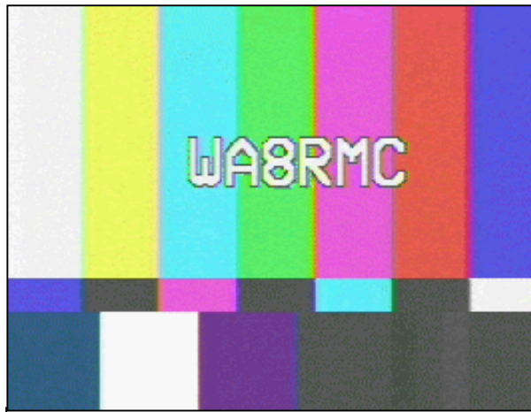
P5 - Signal 30 dB stronger than P0 and represents a 1000 times stronger power level from sender. Picture is snow free.