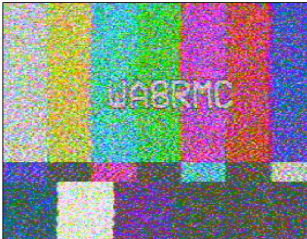
P2 - Signal 12 dB stronger than P0. Picture easily recognizable but lacks detail and still quite snowy.