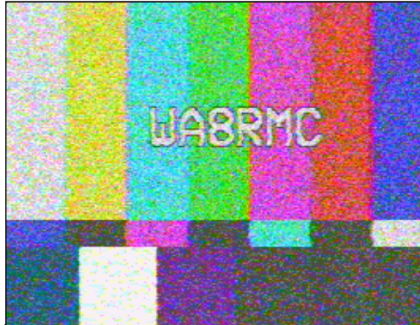
P3 - Signal 18 dB stronger than P0. Picture detail is much better but snow is still visible.