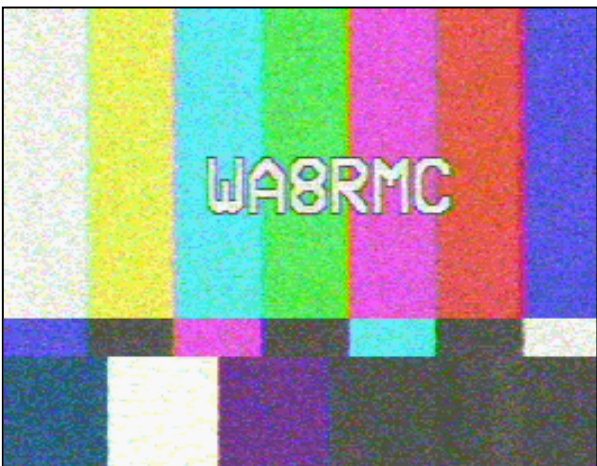
P4 - Signal 24 dB stronger than P0. Picture detail is better with very little snow.